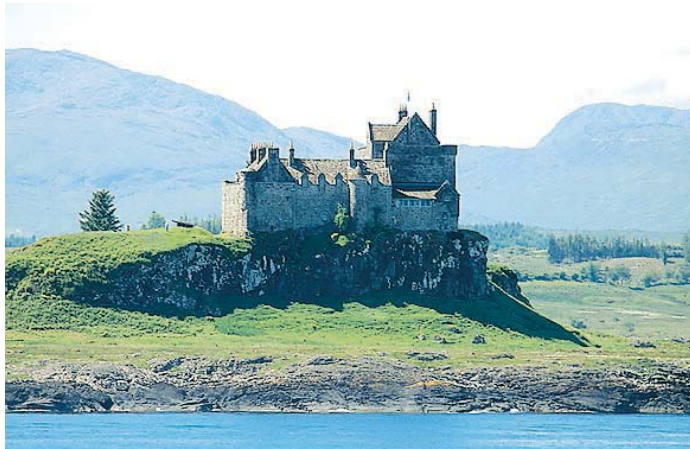
The impressive Duart Castle

If you're a history buff a visit to Duart Castle should satisfy you. This 13th century seat of the Chief of Clan MacLean is